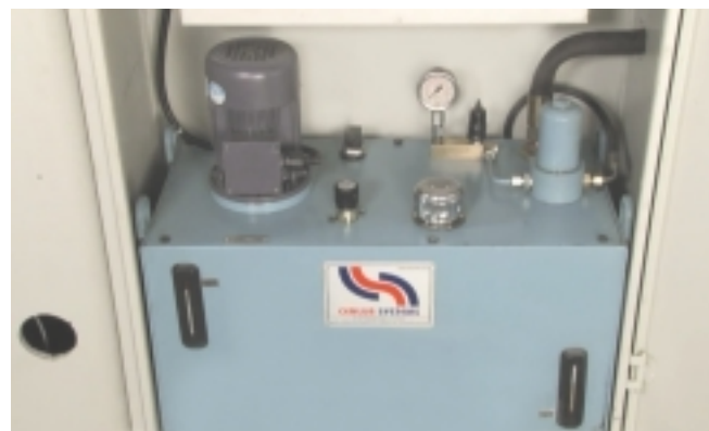
AUTOMATIC MOTORISED RECIRCULATING LUBRICATION