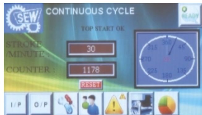
USER FRIENDLY TOUCH SCREEN HMI WITH FUNCTION & FAULT FINDING DISPLAY